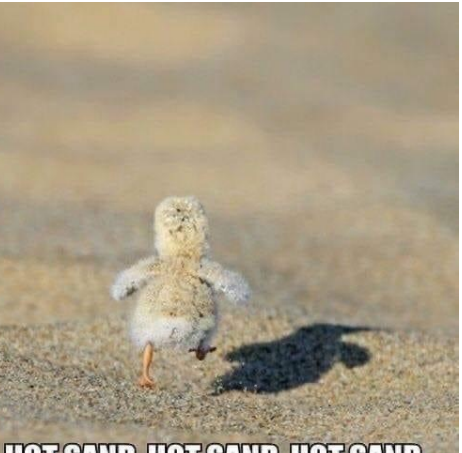
HOT SAND, HOT SAND, HOT SAND,...