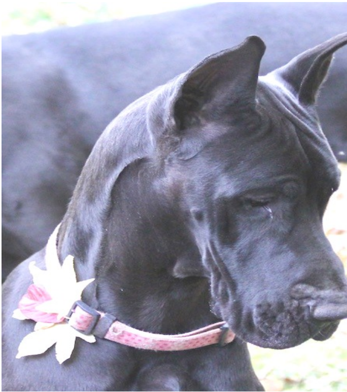
#4 They always look sad