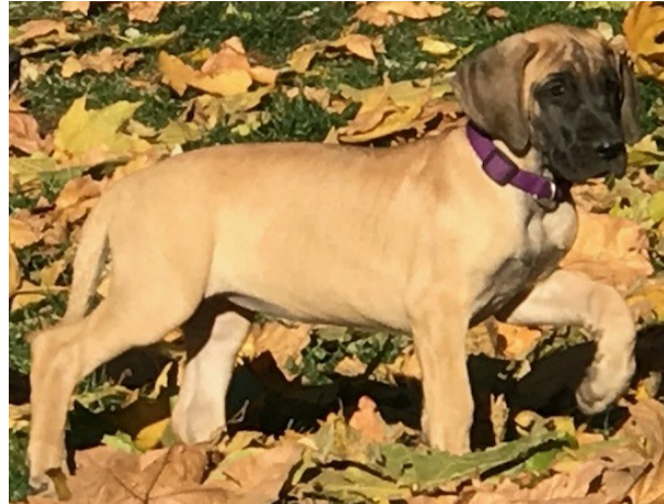
Fall is here and puppies love falling leaves.