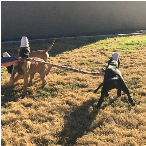
As fast the puppies grow , the seasons will change