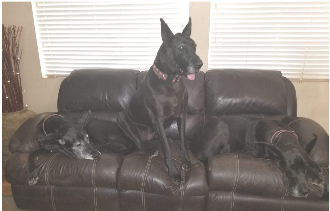
#5 Sitting weird is perfectly comfortable for them