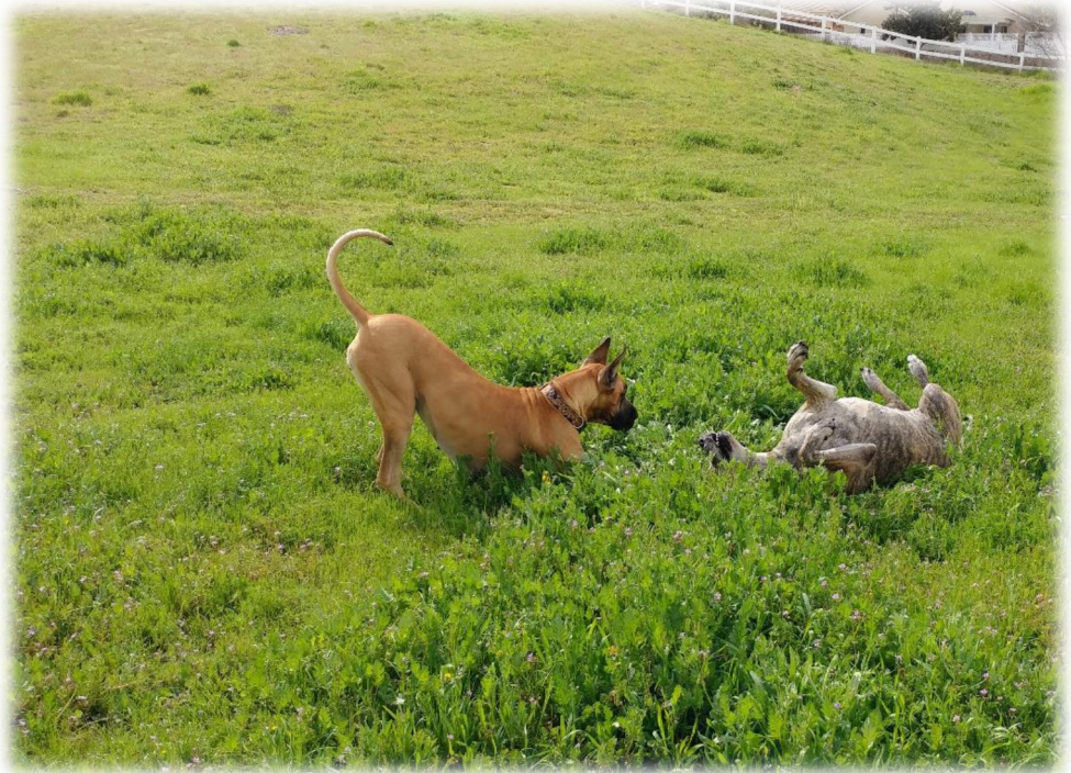
Loving the summer months