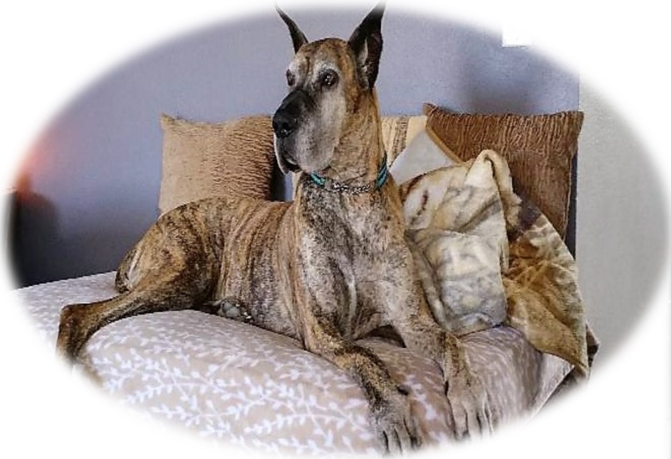
Hogging the ottoman, waiting for you to come cuddle or the chair will do in a pinch.