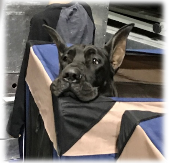
Or I will find something else if you aren't around