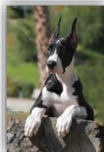
CH DeYoungs Siegfried V. Bubba Rondo X MBISS GCHS Ink Spot's From Sea To Shining Sea AOM

Glory and Ziggy had a Beautiful litter and most will be making their debut at the National!!! We are very excited about our up and coming Babies and the amazing and loving show homes that are now part of our extended family!!