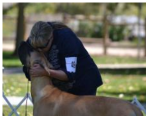
Best in Match