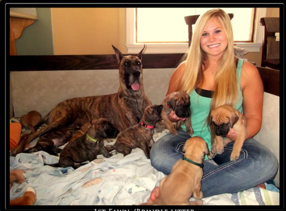
1ST FAWN /BRINDLE LITTER 4 BRINDLE MALES, 1 BRINDLE FEMALE, 1 FAWN FEMALE, 2 FAWN MALES