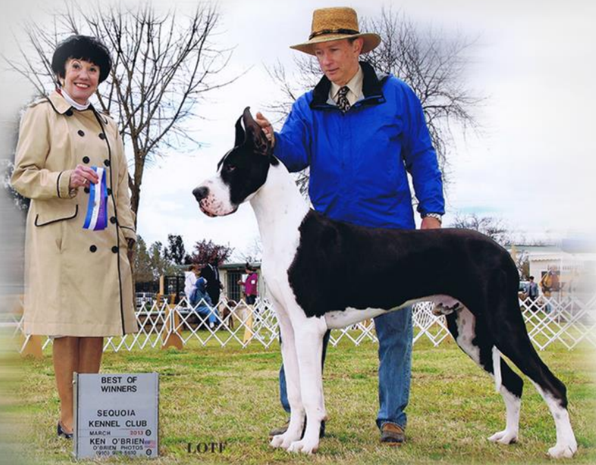
Pictured at 9 months old