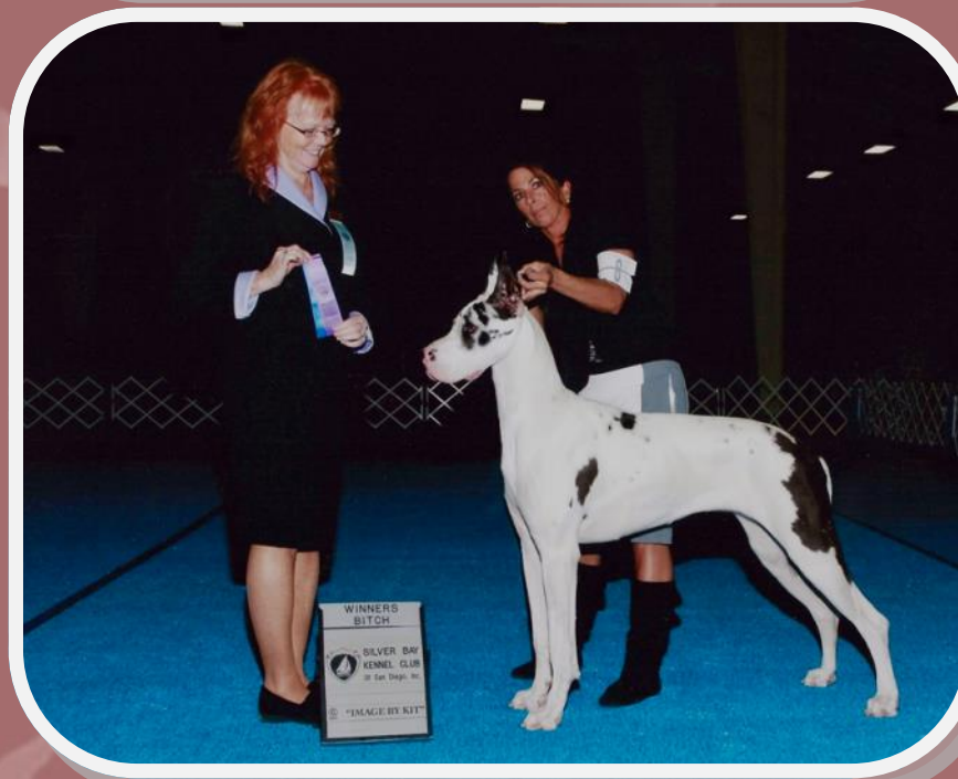
Daneridges Bet'r Late Than Nev'r