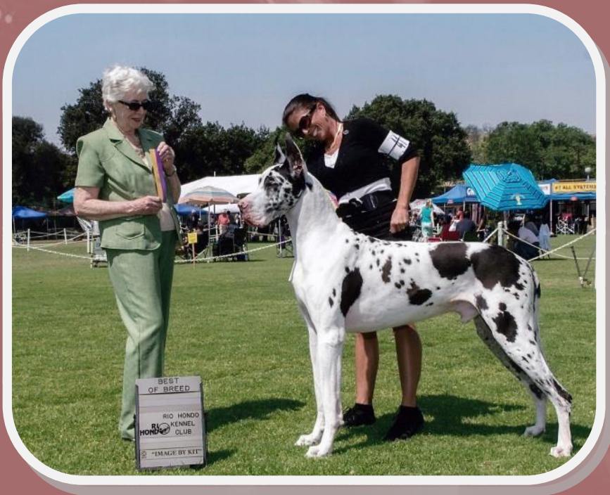
CH. JamesDane Daneridge Hi-Stake's Gunslinger Multiple Best of Breed Winner