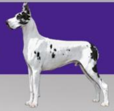
CH Thor-Kourt's TAKU Trafokur AOM CGC

1st day eligible for the 9-12 Month Puppy Class, 2nd weekend out, & 3rd time in the showing!!