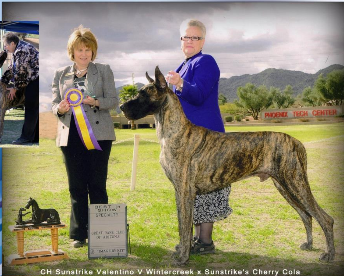
CH Sunstrike Valentino V Wintercreek x Sunstrike's Cherry Cola

MBISS GCH Sunstrike Spellbinder At Karmel CGC AOM Top 20 Contender Multiple Breed Winner - Multiple Group Placings - Multiple Best In Show Specialties