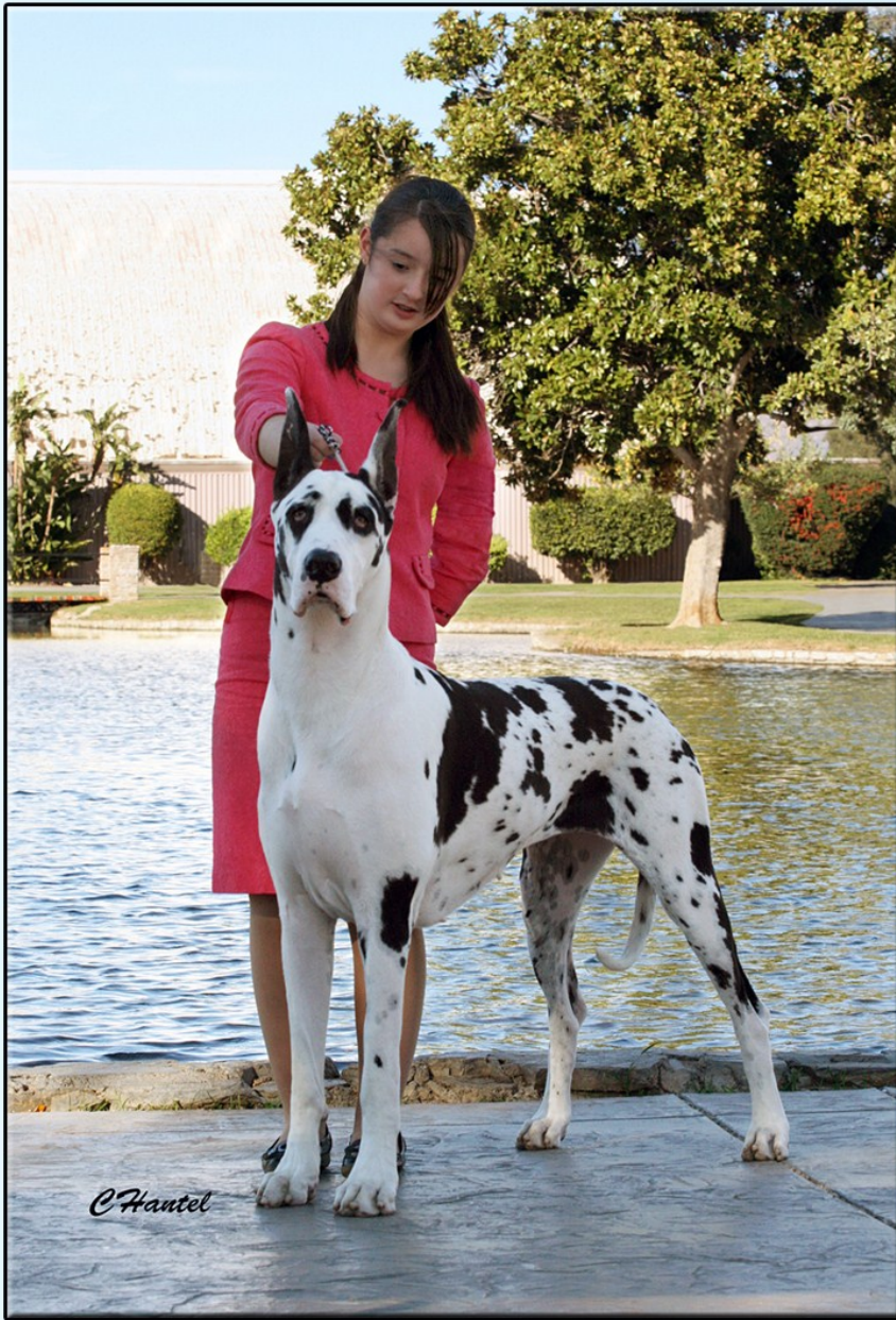
CH. PCH I Came To Get Down V Highlander "Vendetta"