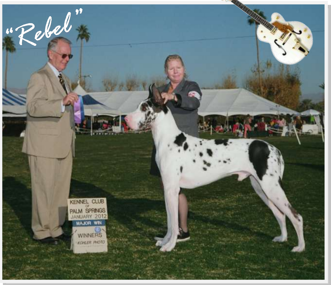
CH. Thor-Kourt's Taku Trafpokur AOM CGC x CH. Ink Spot's Fashionably Late AOM CGC