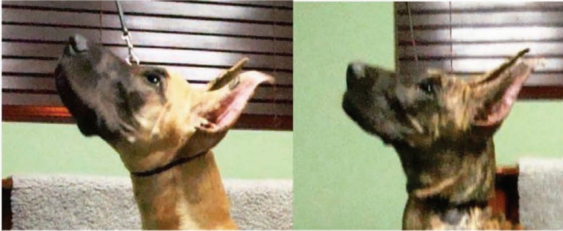
Ch. Windy Hill's Ruff n Ready v BRF and Fin Ch. All About the Daisy Chain

Uh...Oh...More Neet Puppies Being Naughty... Coming soon to a ring near you..... We apologize in advance :D)