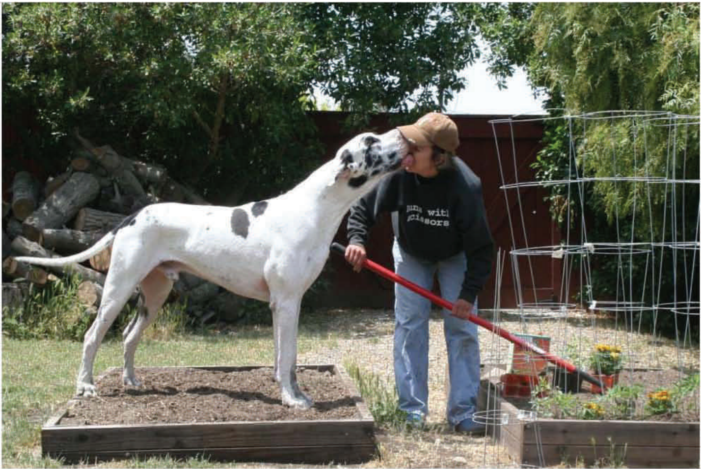
BIS BISS CH GMJ's the Five Card Studd 2xAOM HOF x Thor-Kourt's Trafia Kobrklar