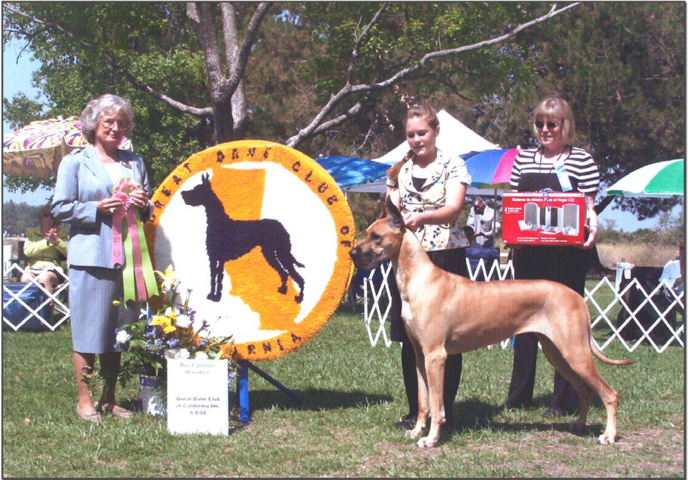
Ch. GilhamWolke Run'n The Gamut x Lampe's Tiger Lilly