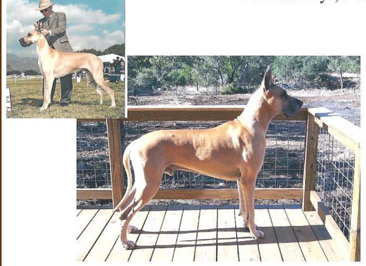
CH. Memores Cool Hand Luke VRaseac (Am. BIS,BISS, CH./BIS Can. CH. Lagarada Reach For The Starz ROM X CH. Rosha TwoStep Cowgirl Bailey)

4 brindle boys, 3 brindle girls, 1 fawn girl.