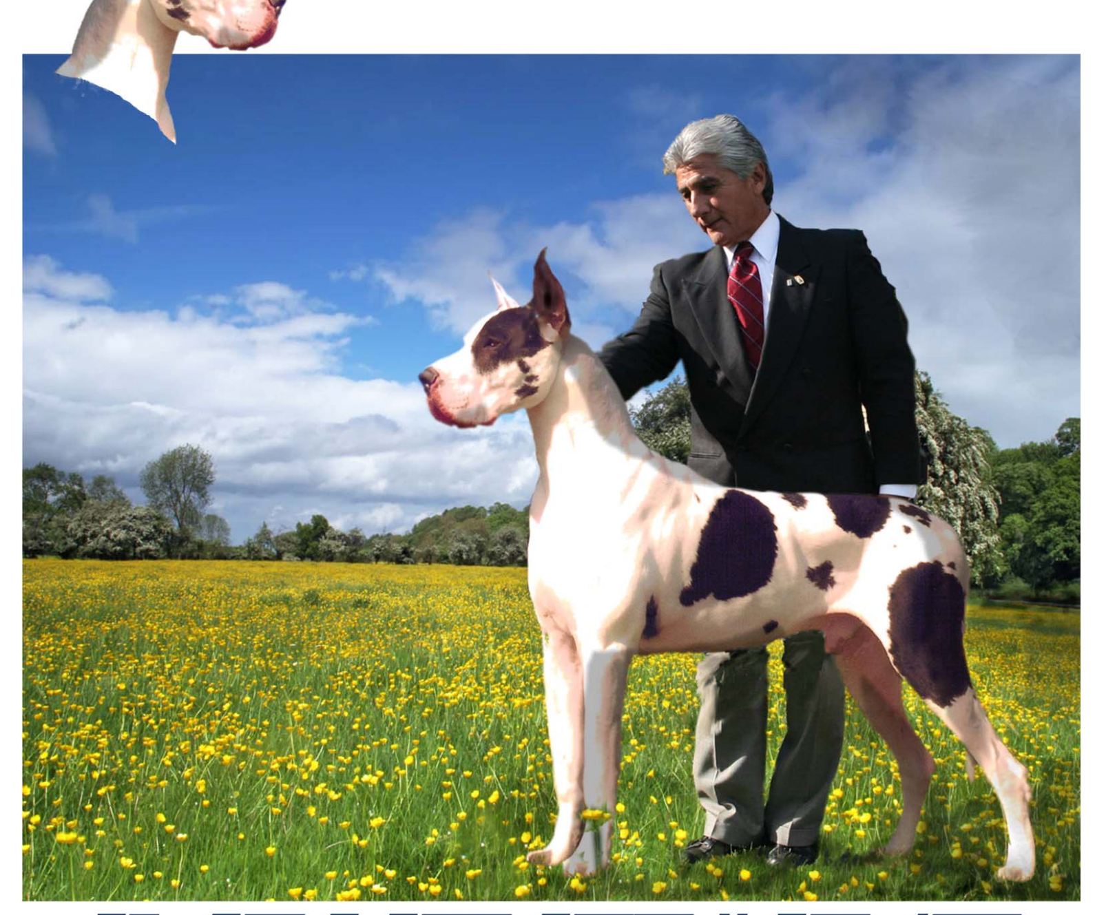
CH. BOX-O-ROKS BENNY-N-THE JETS