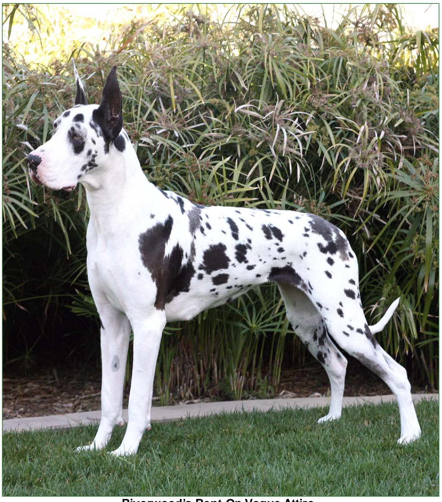
Riverwood's Bent-On Vogue Attire